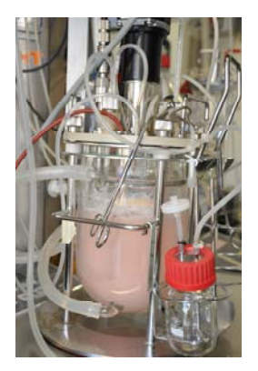
Culture of halophiles in a corrosion resistant bioreactor

The technology relies on halophilic microorganisms for the recycling of waste streams. Halophilic microorganisms are capable of growing on a wide variety of carbon sources. They reported to grow on different organic acids, diverse sugars, the sugar alcohol glycerol and even compounds, aromatic among others. In addition are they producing metabolites secondary