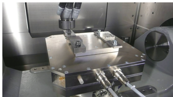
Fig 2: Prototype