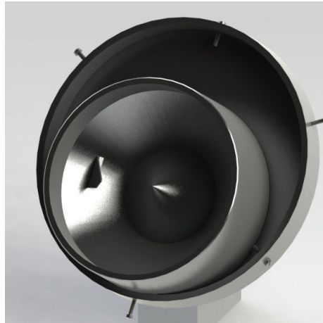
Figure 1: Special shaped inner vessel in a bigger rotating vessel

Magnetron sputtering is one of the most widely used methods for thin film deposition. It can be utilized to manufacture nearly every metal coating or metal composite as well as nitride, oxide, carbide, fluoride and arsenide layers with controlled stoichiometry, thus making magnetron sputtering a most versatile coating method. The possibility to coat large area substrates and the easy-to-handle process parameters of magnetron sputtering enable a wide range of industrial applications.