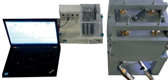
Fig 1: VFT rig - main parts

The new developed VFTP enables a quick, direct and accurate test of the asphalt concrete flexibility in various stages (suitability tests, acceptant tests, control tests etc.). Specimens for testing with a dimension of 250x250xh [mm], wherein h describes the thickness of the facing can be produced in laboratory or can be cut out from an existing asphalt facings. The test samples can be installed very quick and easily. In order to simulate the acting water pressure on the facing close to reality, a surface load during the test procedure evenly loads the sample. A special feature is that the load transmission is uniformly despite material deformation, this leads to stress distributions as in the field (see Fig 2). Beneath the sample is an under pressure chamber. If cracks through the specimen occurs as a result of the deformations a pressure equalization between the under pressure beneath the sample and the